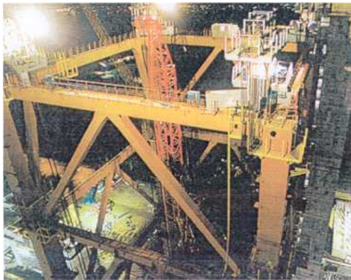
Fig. 3 Building construction with heavy plates: Power Station Schwarze Pumpe