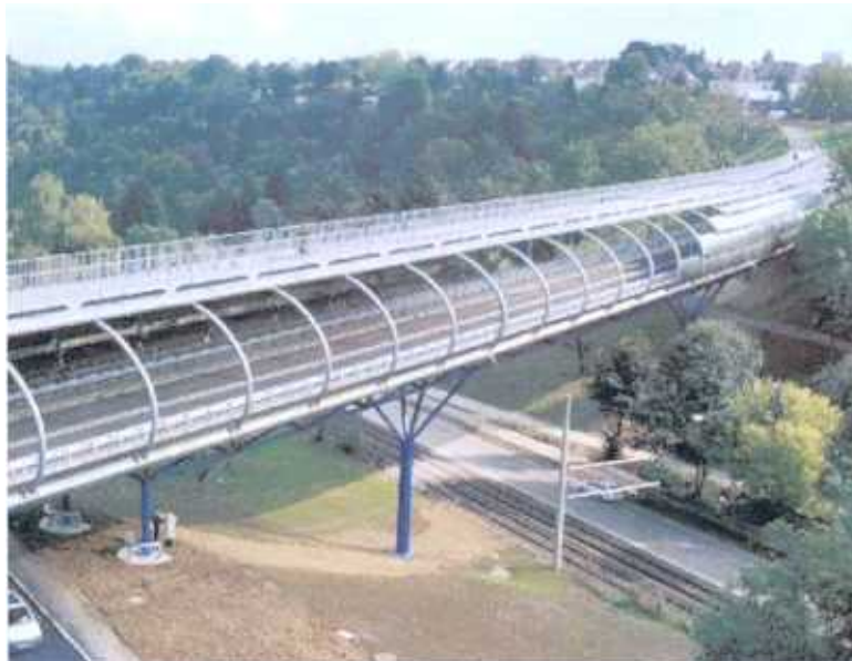
Fig. 5 The Nesenbachtal-bridge

the first bridge in Germany using this material. Another recent example for the usage of this special steel grade is the road bridge in the GVZ Ingolstadt in which especially graceful and thin pile heads could be designed.