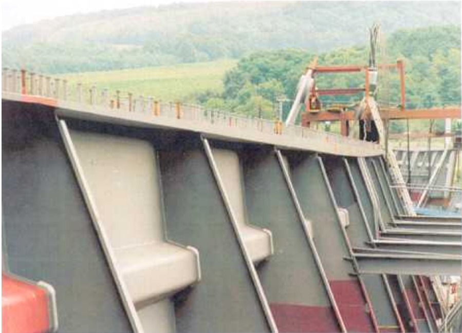
Fig. 2 LP-plates (wedge-shaped) in the upper flange of the bridge Schengen